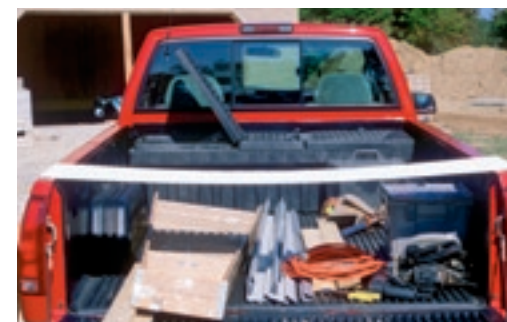
Ordinary soffits can't support their own weight over a long expanse.

KP I-Span features a smooth, matte texture that never needs painting. It's virtually maintenance free; it won't rot, peel, chip, flake, or blister. And the Intellivent™ invisible venting system provides necessary attic ventilation without calling attention to your overhang with unsightly perforation. Every panel looks uniform. KP I-Span soffit is the perfect complement to any KP siding.