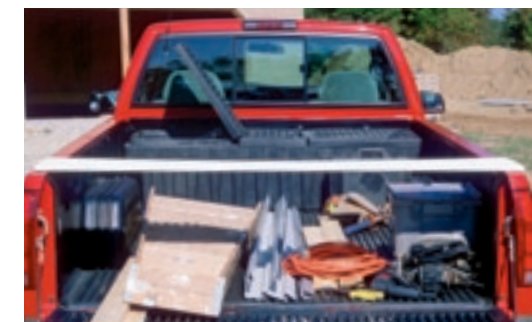
KP I-Span's I-beam construction provides added rigidity to span distances up to 48".