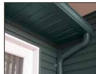
Aluminium Trims & Accessories