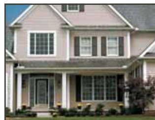
TrimFX® Decorative Vinyl Trims

Read our full warranty for details. They are available from any KP distributor or on our website at www.KPproducts.com