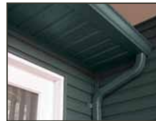
Aluminium Trims & Accessories